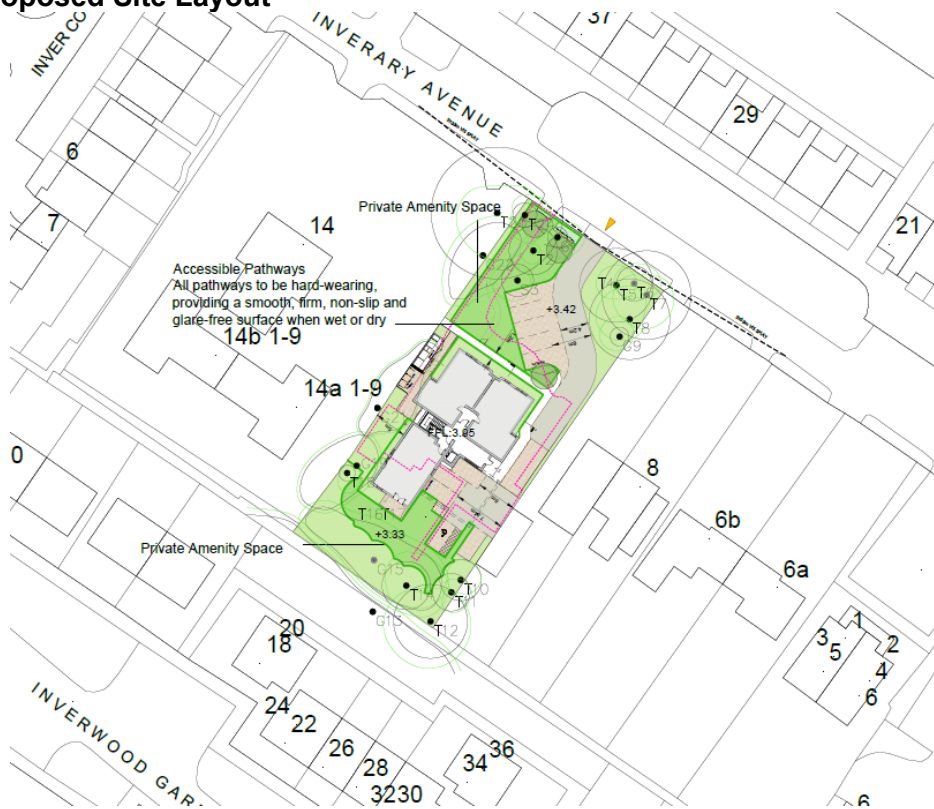
Fig.2 Proposed Site Layout